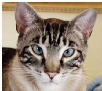
Seabiscuit had an uncredited cameo role in KCET's "The Paw Project"