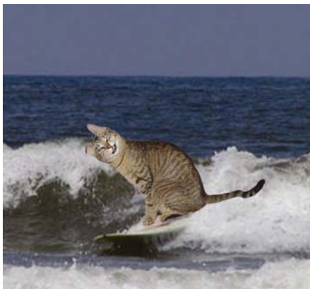
Above: "Hanging ten" claws in Malibu. Far right: Berkeley's most famous scratching post.

Four California cities, West Hollywood, San Francisco, Malibu, and Berkeley, have now passed resolutions condemning the practice of declawing, indicating the growing number of people who believe that declawing animals is inhumane and that sensible alternatives can be used to control scratching. The city of West Hollywood passed the first resolution against declawing and then went on to pass its precedent setting anti-declawing ordinance in April, 2003. In Berkeley, the resolution calls for an end to ear-cropping and tail-docking, as well as declawing.