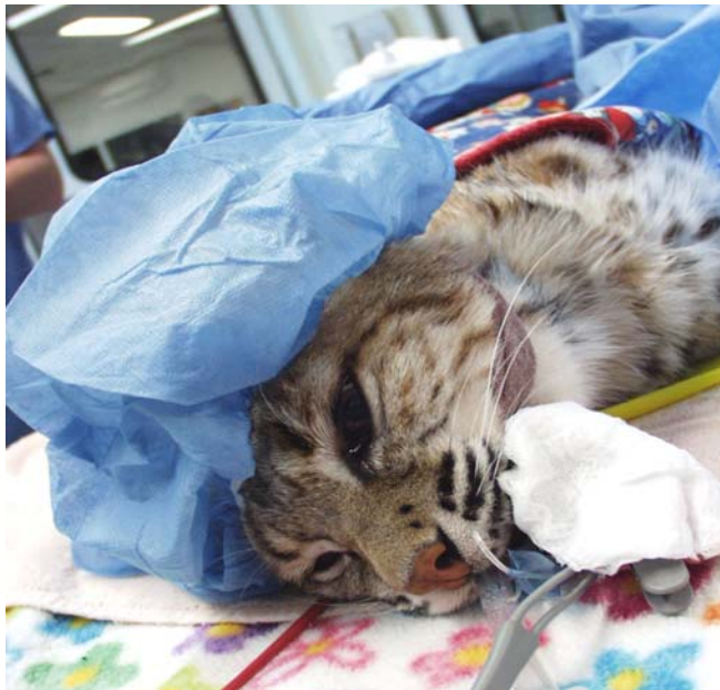
Pictured above: Pablo, one of the bobcats at The Nature of Wild-works in Topanga, CA.

At right: Pablo's infected paw prior to surgery has atrophied pads and abnormal bone positioning. Reconstructive surgery alleviated pain from bone fragments and repositioned the pads.